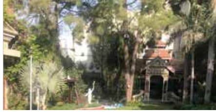
Upcoming Fountain House Faisalabad